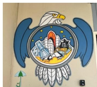
Kelly Park's Treat & Toy Trolley \ Mural dedicated to Astronaut John Young