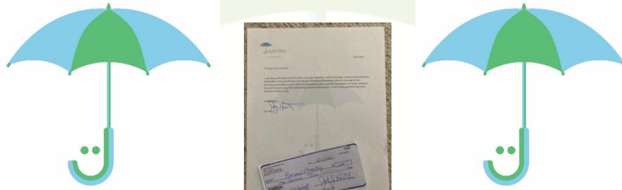
Jaysmiles Fun—Grant Award letter

After all proposals were reviewed, each school's principal was recognized and presented a check for $1,000.00 allowing them to go forward with their request.