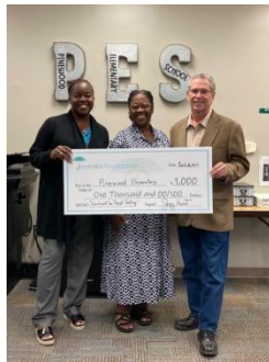
Pinewood - $1,000.00 John Young - $1,000