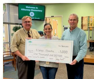
Killarney Elementary - $1,000 Kelly Park - $1,000